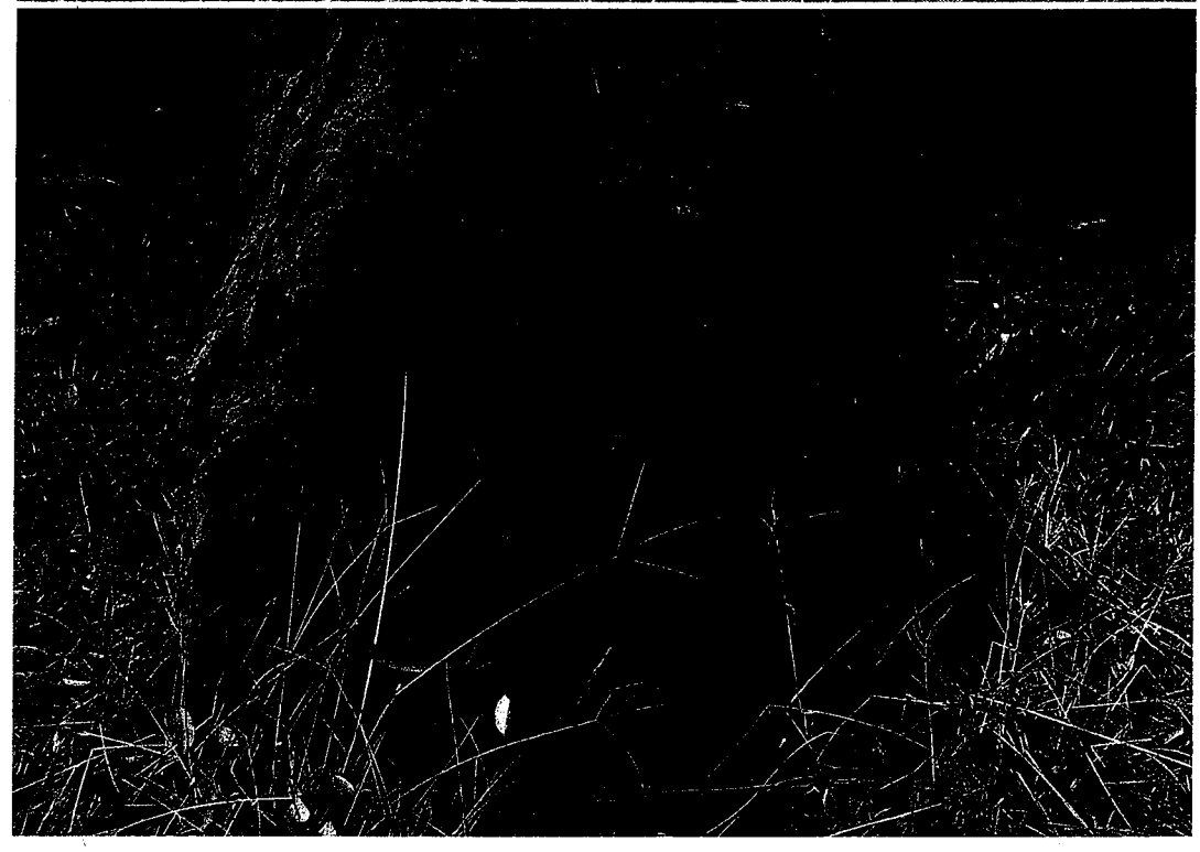
PHOTO BY: LC DIRECTION: PHOTO FILE NAME 101304-lc-6408 Reinder-Cole-006

PHOTO BY: LC DIRECTION: PHOTO FILE NAME 101304-lc-6408 Reinder-Cole-005