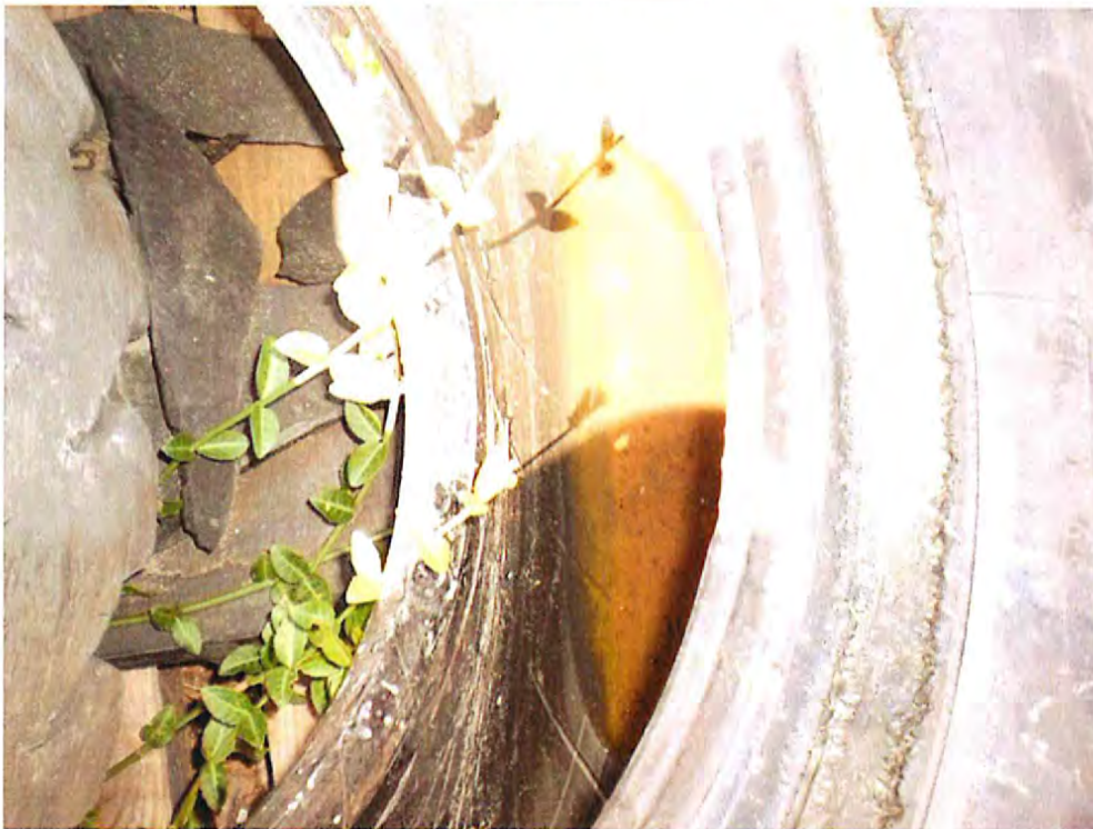
Date: 7-17-13 Time: 11:33am Direction: down Exposure #: 008 Comments: Attempting to photograph the mosquito larva observed in this used tire holding water.

File Names: 1650205113~07172013-[Exp. #].jpg