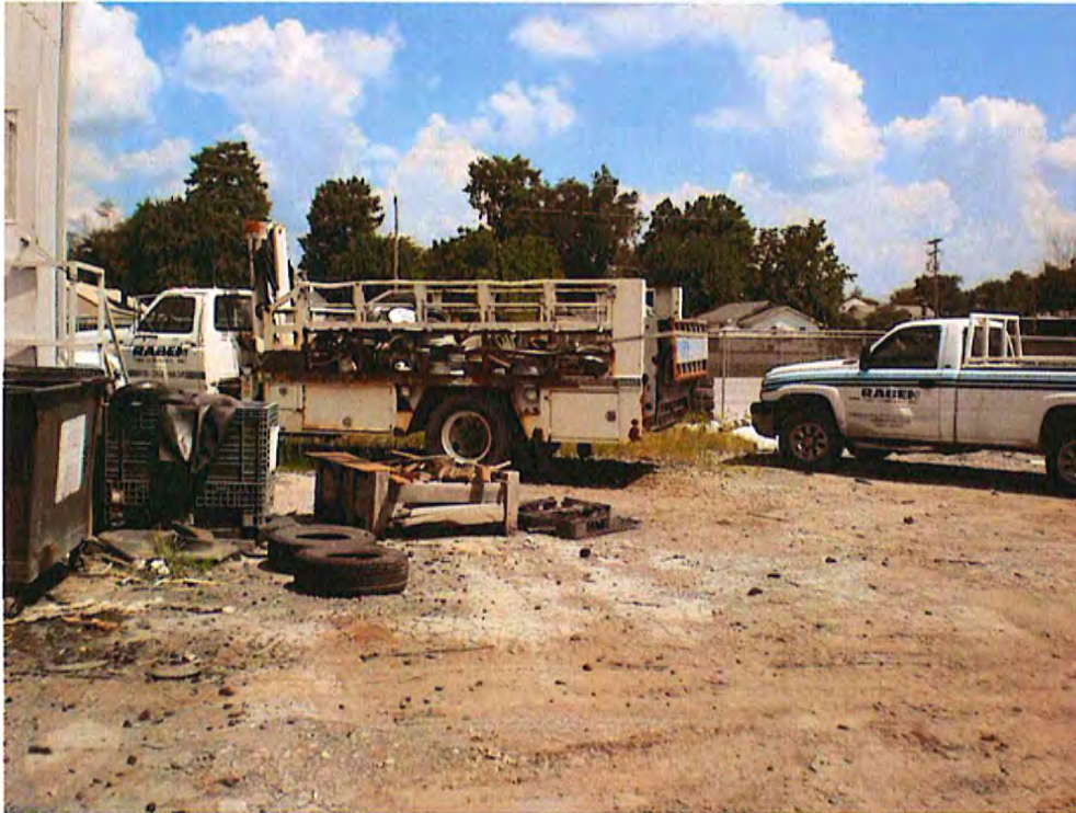
Date: 7-17-13 Time: 11:30am Direction: N Exposure #: 001 Comments: Used tires.