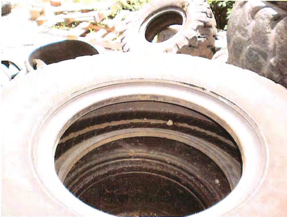
Date: 7-17-13 Time: 11:32am Direction: down Exposure #: 007 Comments: Used tires holding water