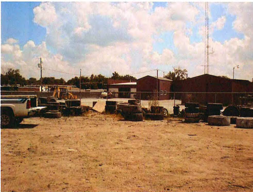
Date: 7-17-13 Time: 11:30am Direction: NE Exposure #: 002 Comments: Used tires.

File Names: 1650205113~07172013-[Exp. #].jpg