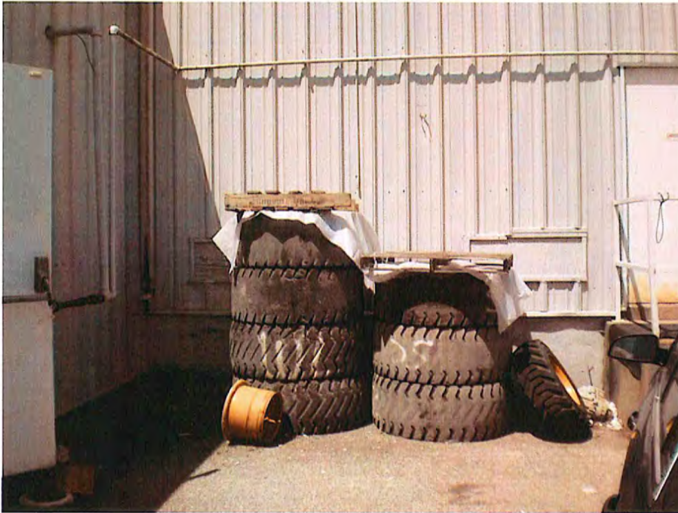
Date: 7-17-13 Time: 11:31am Direction: W Exposure #: 005 Comments: Barrel- stacked tires covered with plastic.