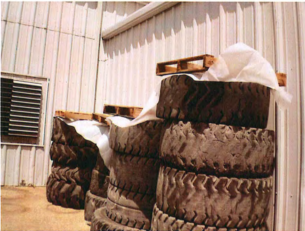
Date: 7-17-13 Time: 11:31am Direction: NW Exposure #: 006 Comments: Barrel- stacked tires covered with plastic.

File Names: 1650205113~07172013-[Exp. #].jpg