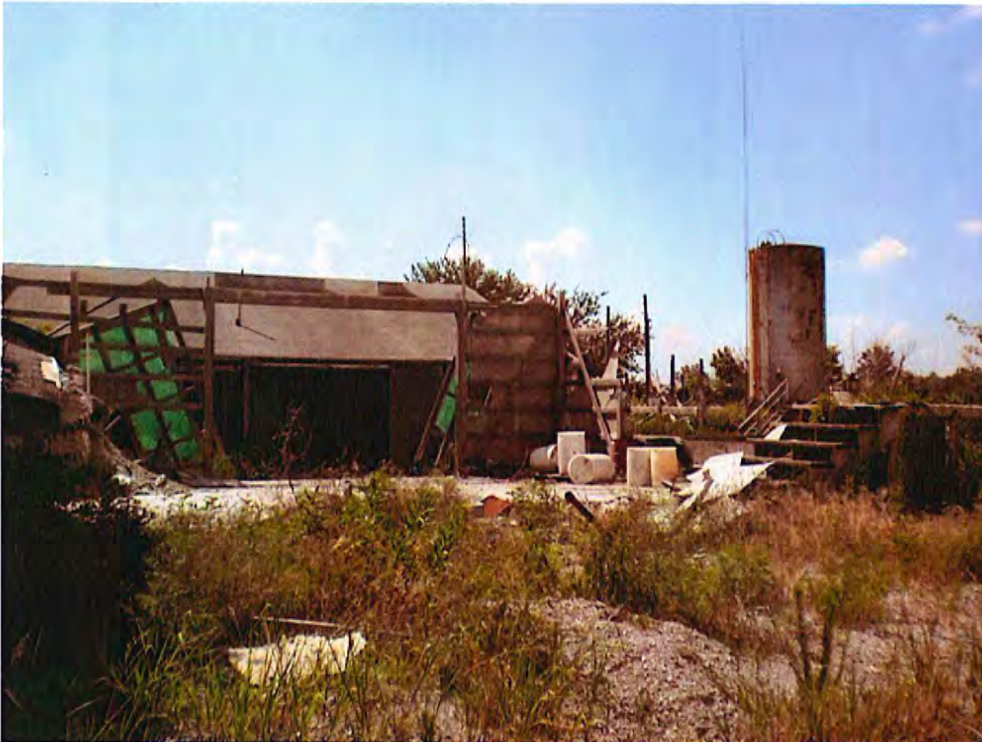
Date: 7-17-13 Time: 10:38am Direction: SE Exposure #: 001 Comments: General Construction and/or Demolition Debris (GC/DD) and assorted poly and steel drums.