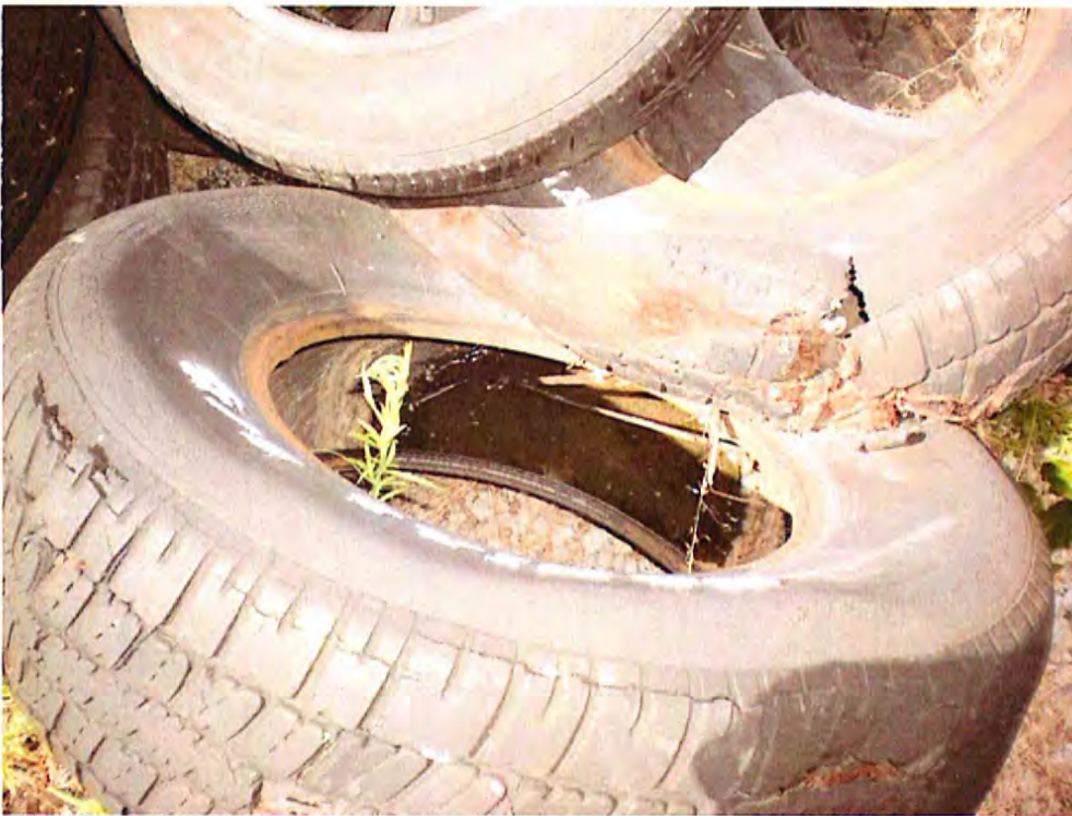
Date: 7-17-13 Time: 10:42am Direction: down Exposure #: 006 Comments: Used tire holding water and mosquito larva.

File Names: 1650205047~07172013-[Exp. #].jpg