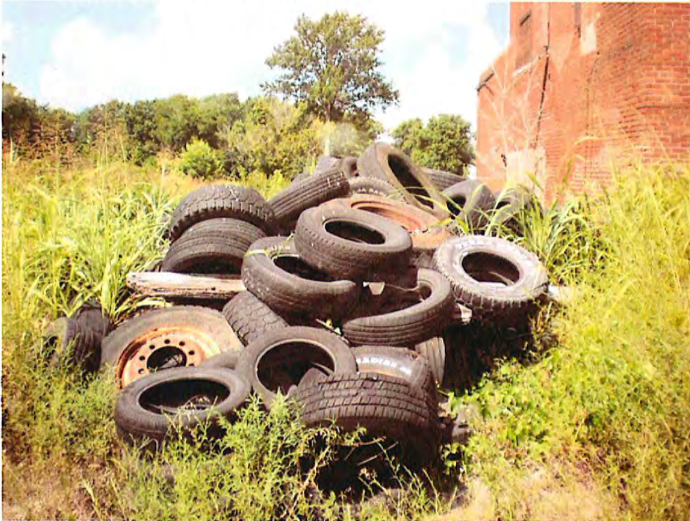
Date: 7-17-13 Time: 10:41am Direction: SW Exposure #: 005 Comments: Used tires holding water and mosquito larva.