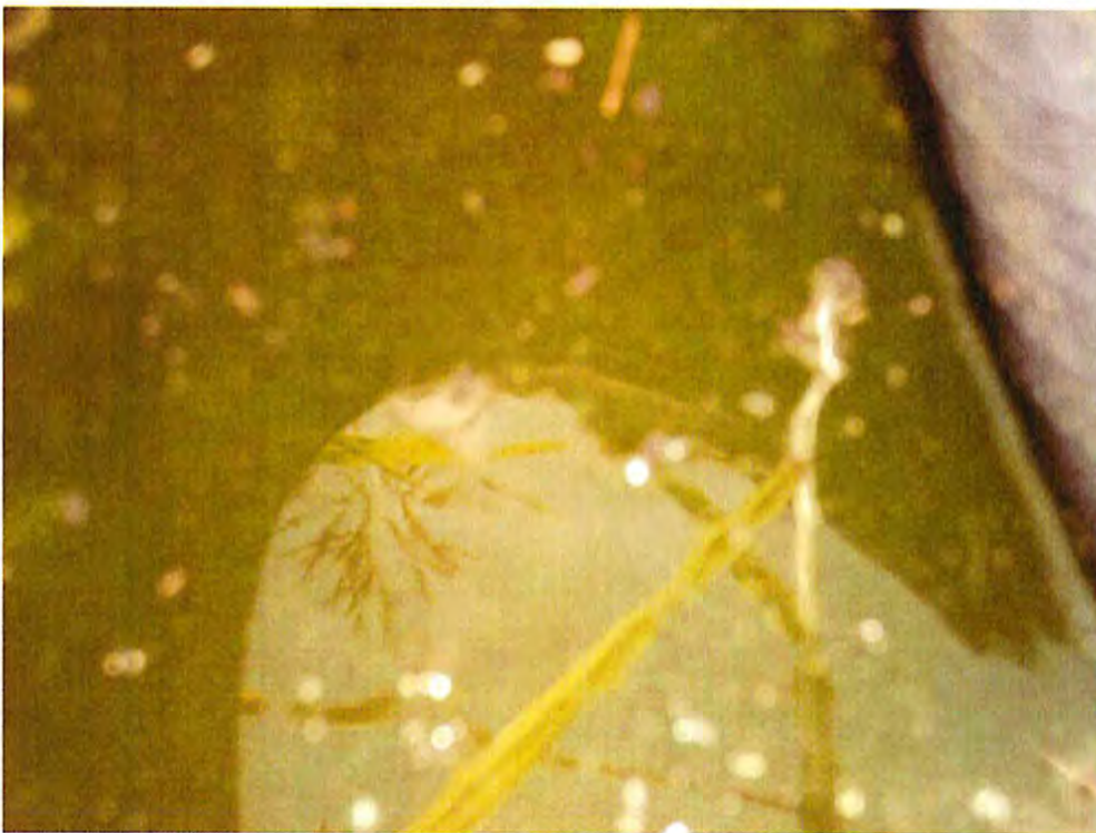
Date: 7-17-13 Time: 10:43am Direction: down Exposure #: 008 Comments: An attempt to document the mosquito larva in the water accumulated in the used tires.

File Names: 1650205047~07172013-[Exp. #].jpg