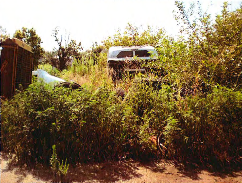
Date: 7-17-13 Time: 10:39am Direction: SE Exposure #: 002 Comments: Used tires and waste vehicles.

File Names: 1650205047~07172013-[Exp. #].jpg