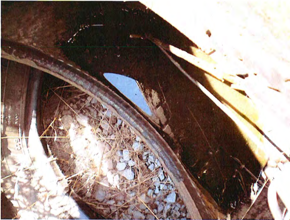
Date: 7-17-13 Time: 10:42am Direction: down Exposure #: 007 Comments: Used tire holding water and mosquito larva.