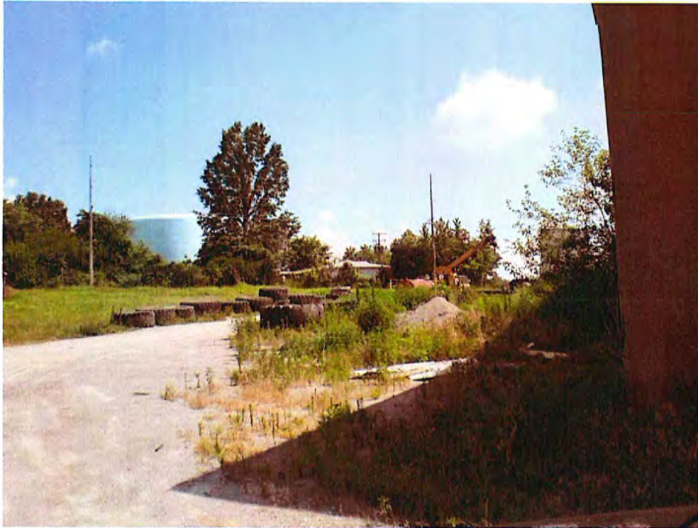
Date: 7-17-13 Time: 10:46am Direction: NE Exposure #: 009 Comments: Used Off-the-Road (OTR) tires allowed to accumulate water.