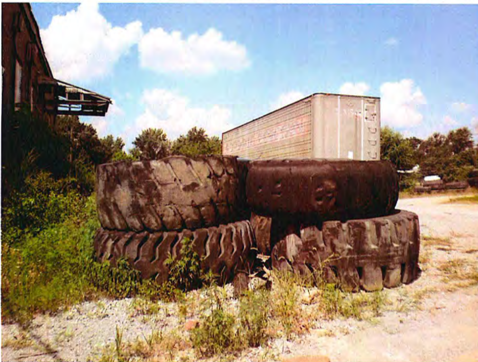
Date: 7-17-13 Time: 10:46am Direction: W Exposure #: 010 Comments: Used OTR tires allowed to accumulate water.

File Names: 1650205047~07172013-[Exp. #].jpg