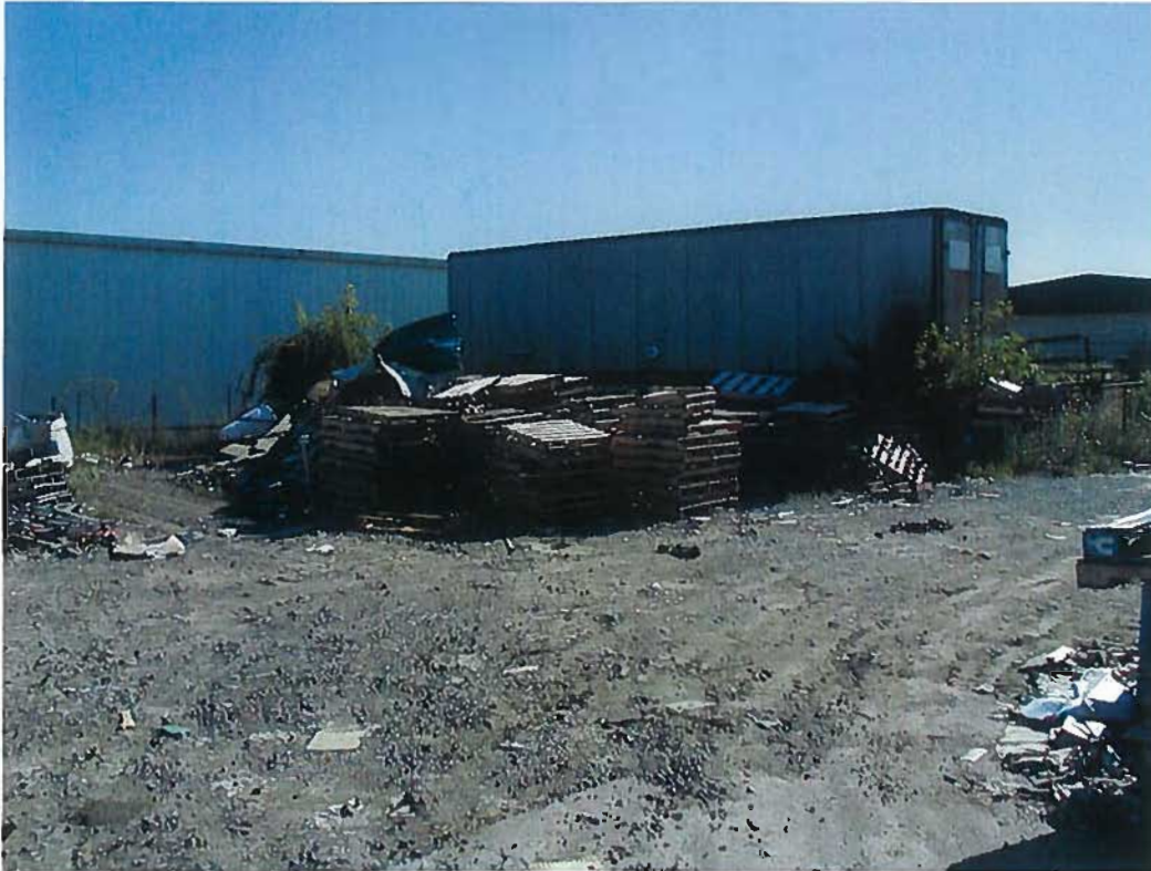
Date: 7/1/10 Time: 9:02am Direction: NE Exposure #: 005 Comments: Wooded pallets stacked on north side of lot.