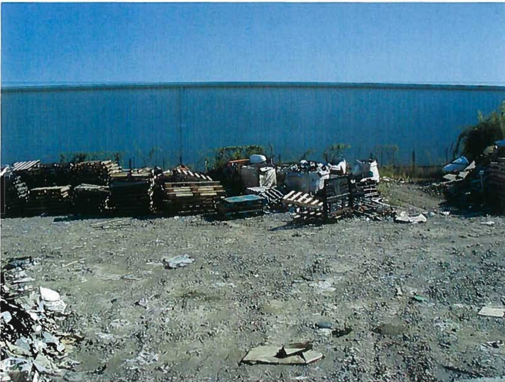
Date: 7/1/10 Time: 9:03am Direction: N Exposure #: 006 Comments:

File Names: 1990555206~07012010-[Exp. #].jpg