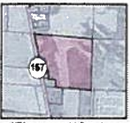
HPA property on hill northeast of State Historic Site